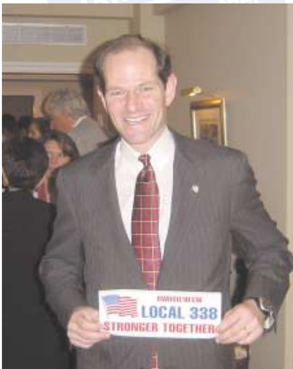
Eliot Spitzer NY STATE GOVERNOR ELECT