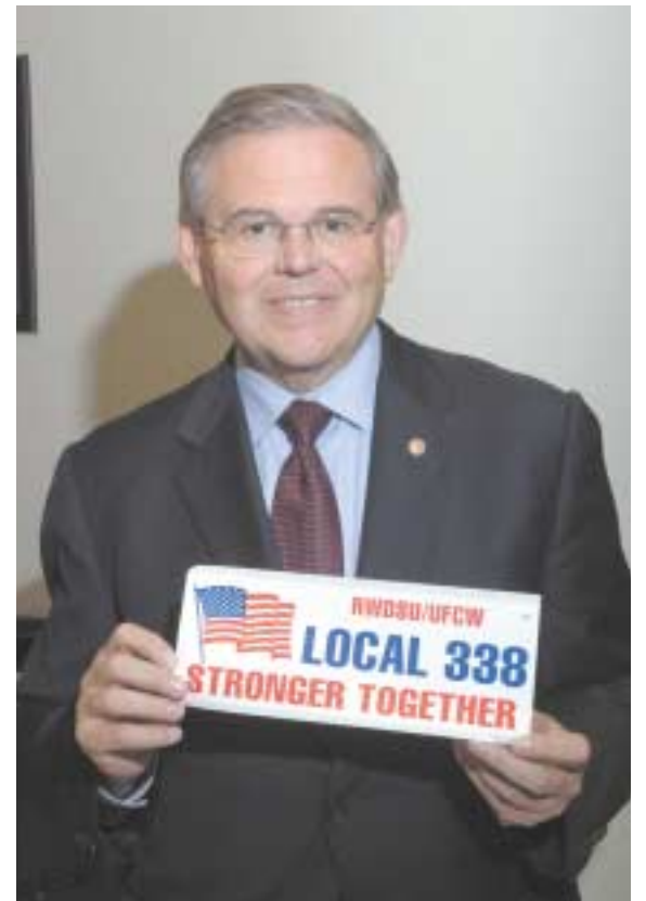
Bob Menendez US SENATOR • NEW JERSEY