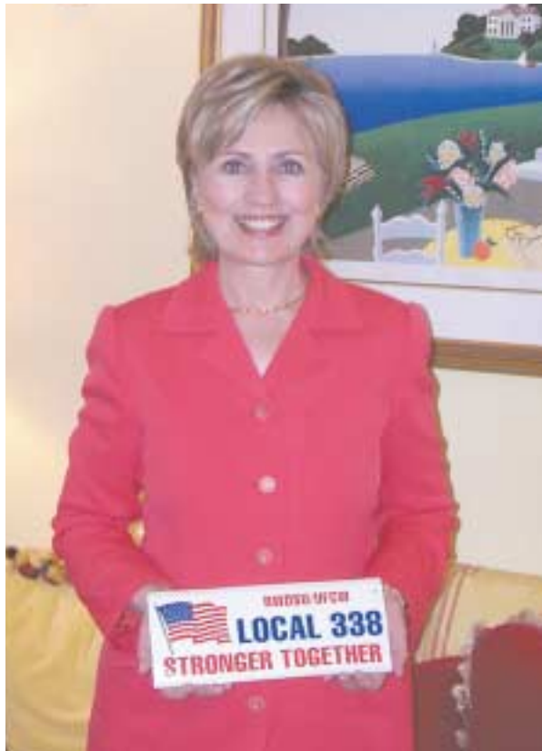
Hillary Rodham Clinton US SENATOR • NEW YORK

With your help, many of Local 338 Friends were elected to office or re-elected to serve and fight for the rights of working families. Here are just a few that wanted to say "Thank You!"