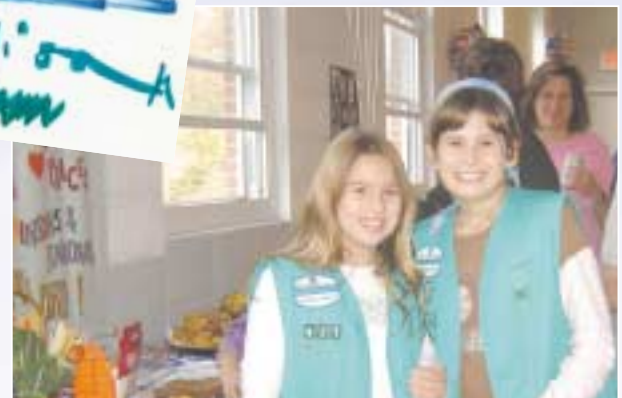
Brownie Troop #431 served "KP" duty & cleaned up