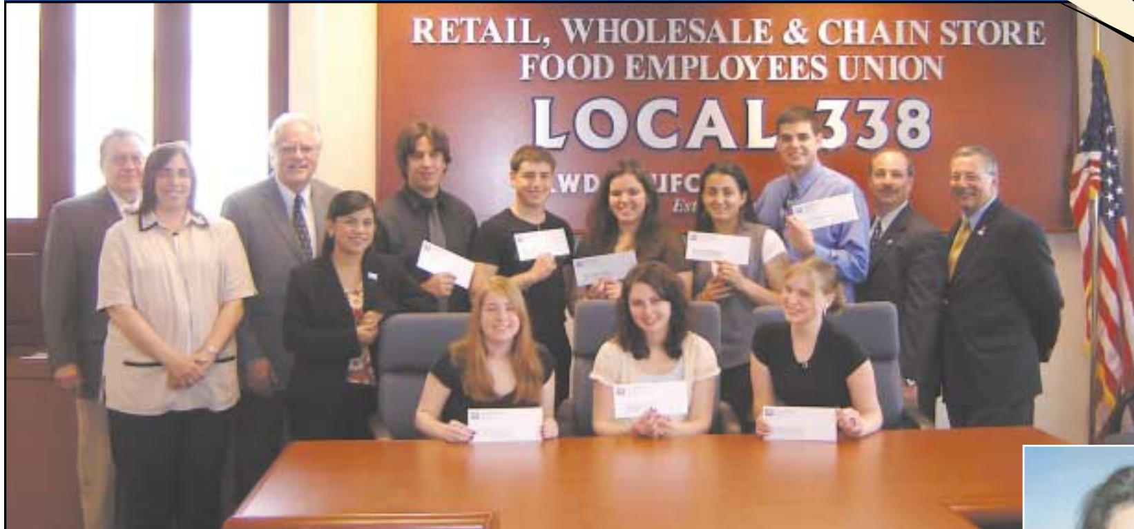
Local 338 Scholarship Committee and the 2006 winners.

F or 24 years, Local 338 has been pleased to offer scholarships to its members and their families.