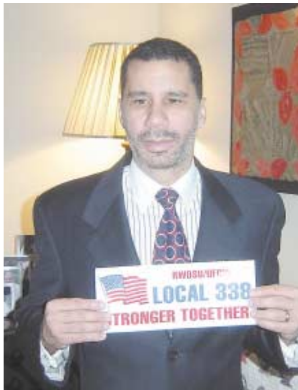
David Paterson NY STATE LIEUTENANT GOVERNOR ELECT