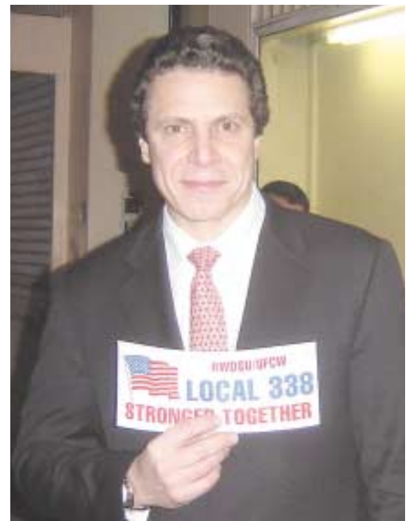
Andrew Cuomo NY STATE ATTORNEY GENERAL ELECT