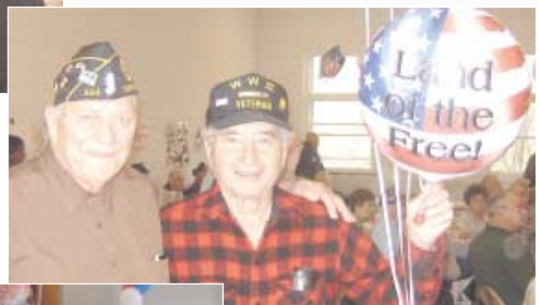
2 Thankful Veterans