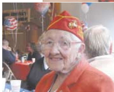
A Proud Veteran & Local 338 Retiree