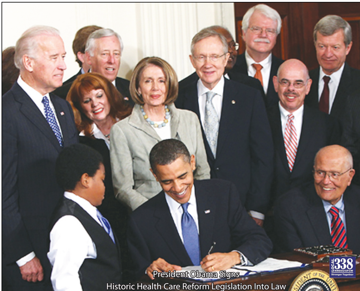
President Obama Signs

Historic Health Care Reform Legislation Into Law